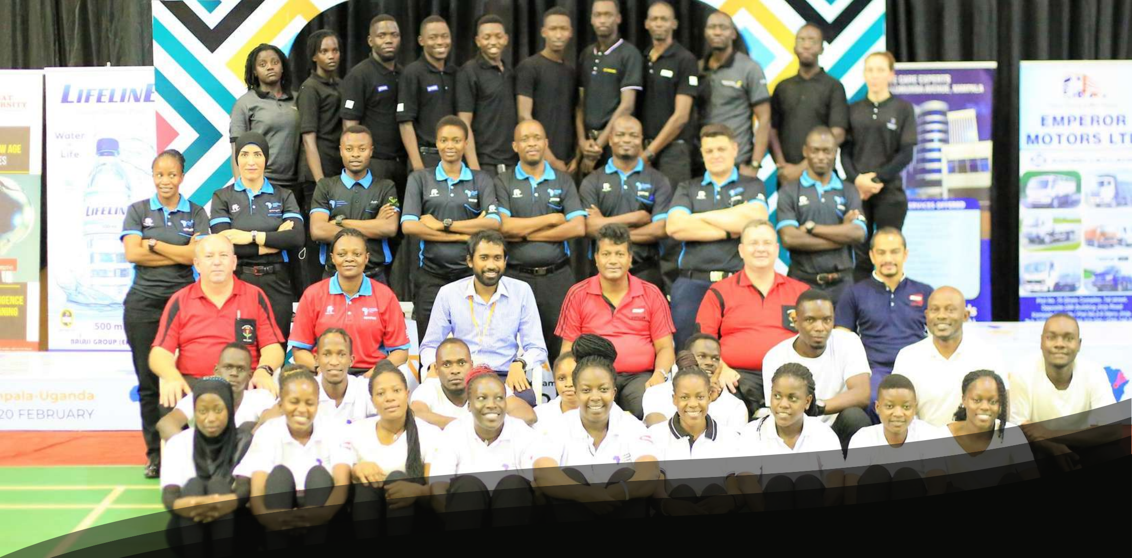
Technical Officials at the All Africa Senior Championships, Kampala- Uganda 2022