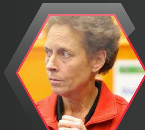
BWF Certified Referee BWF Referee Assessor